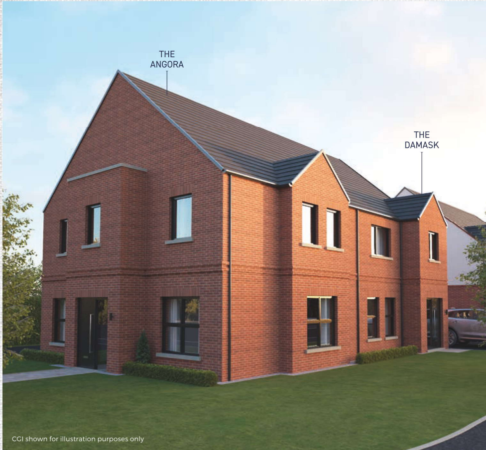
CGI shown for illustration purposes only