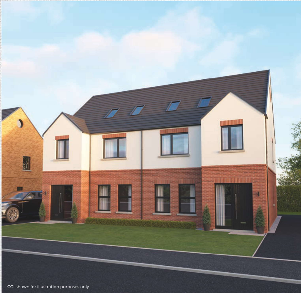
CGI shown for illustration purposes only