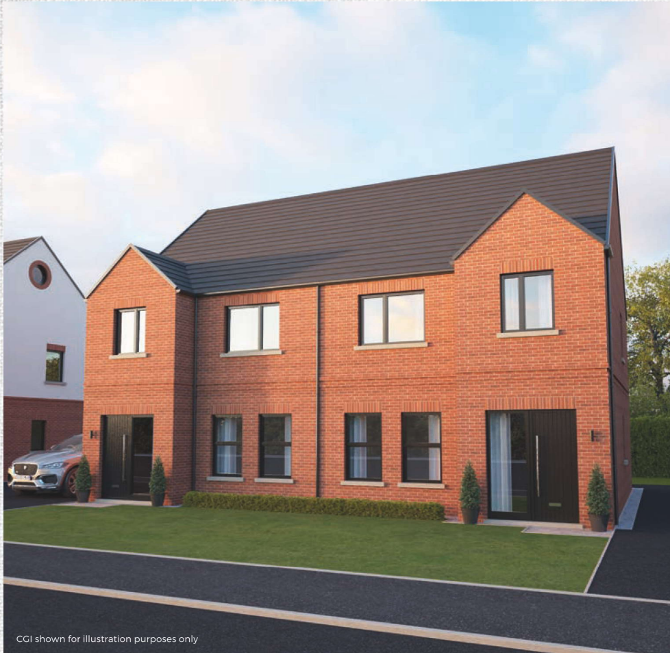
CGI shown for illustration purposes only