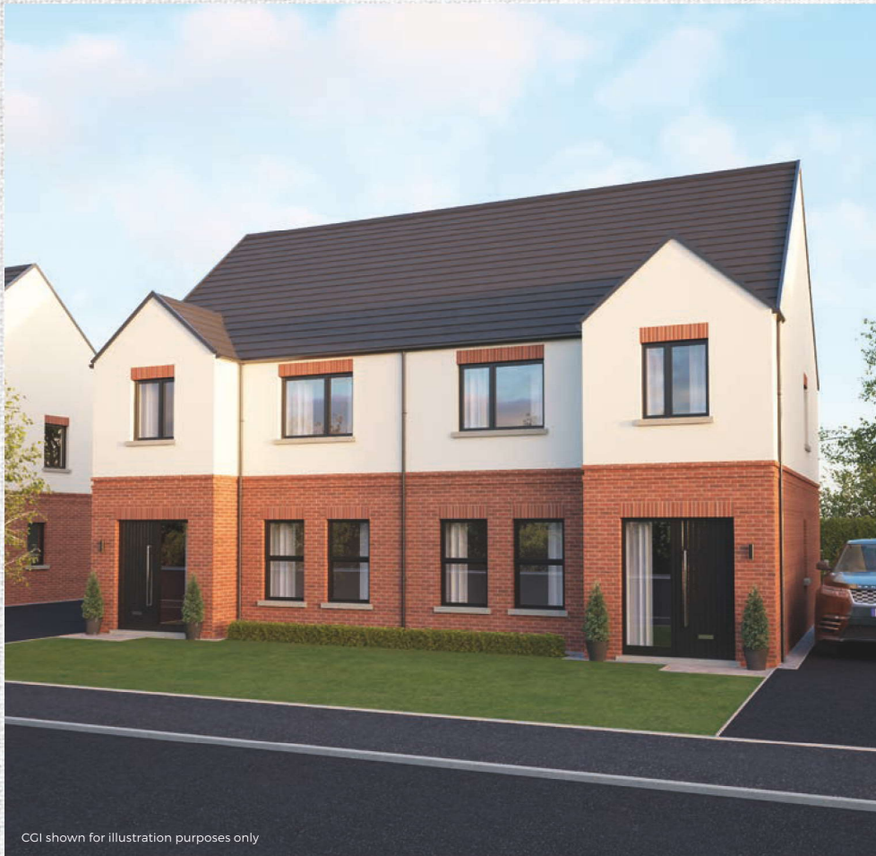
CCI shown for illustration purposes only